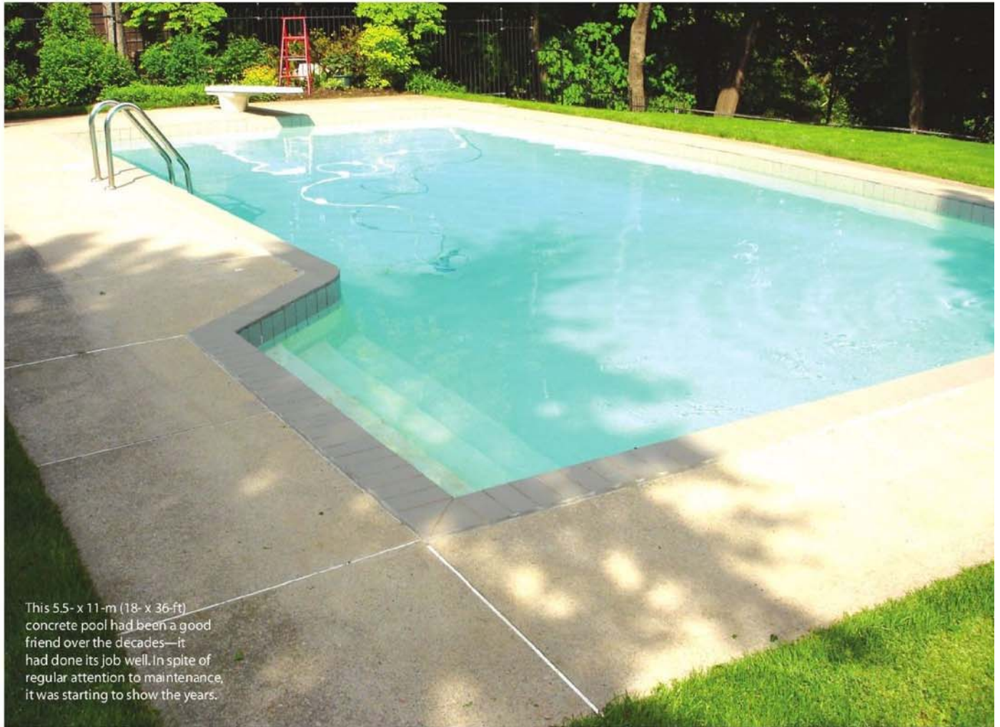
This 5.5- x 11-m (18- x 36-ft) concrete pool had been a good friend over the decades—it had done its job well. In spite of regular attention to maintenance, it was starting to show the years.