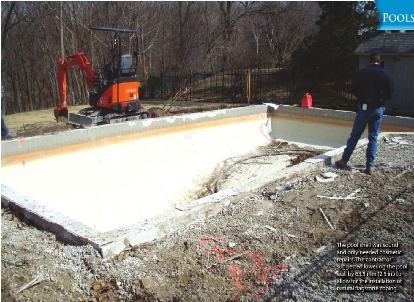
The pool shell was sound and only needed cosmetic repairs. The contractor suggested lowering the pool wall by 63.5 mm (2.5 in.) to allow for the installation of natural flagstone coping.