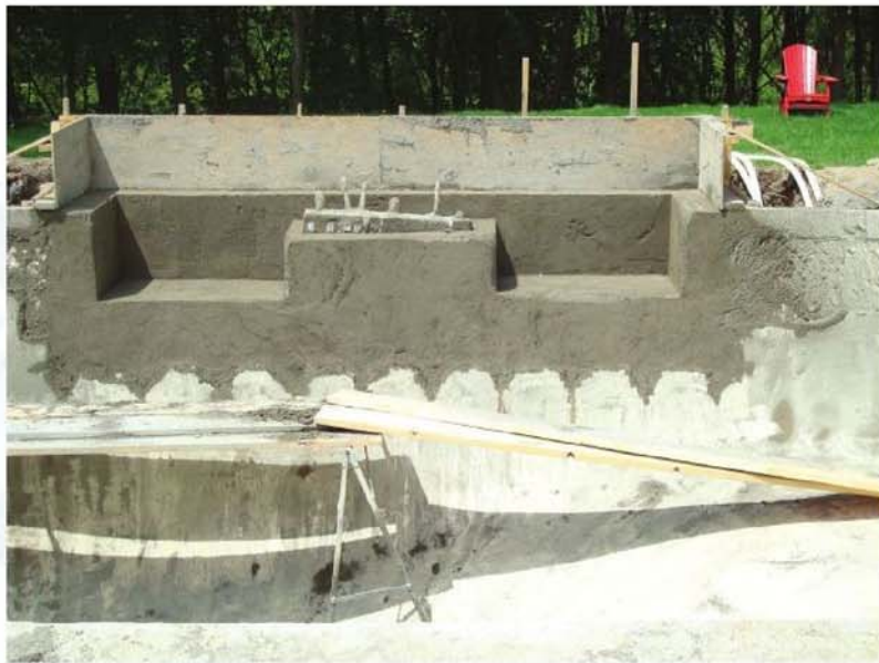
Dry gunite, the strongest concrete available, was used to rebuild the new section of wall. The three-fountain water feature was flanked on each side by underwater swim-up benches.

The only downside was the condition of the pool; sadly, it was starting to show its age. While the owners had been meticulous about maintenance, worn surfaces, faded materials and the occasional crack here and there indicated it was time for renewal. The family had also recently remodelled their kitchen, complete with a gorgeous walkout deck overlooking the pool. A pool renovation was the obvious next step. This story serves as a great case study of a renovation gone right, which can serve as an example to any homeowner looking to spruce up their backyard oasis.