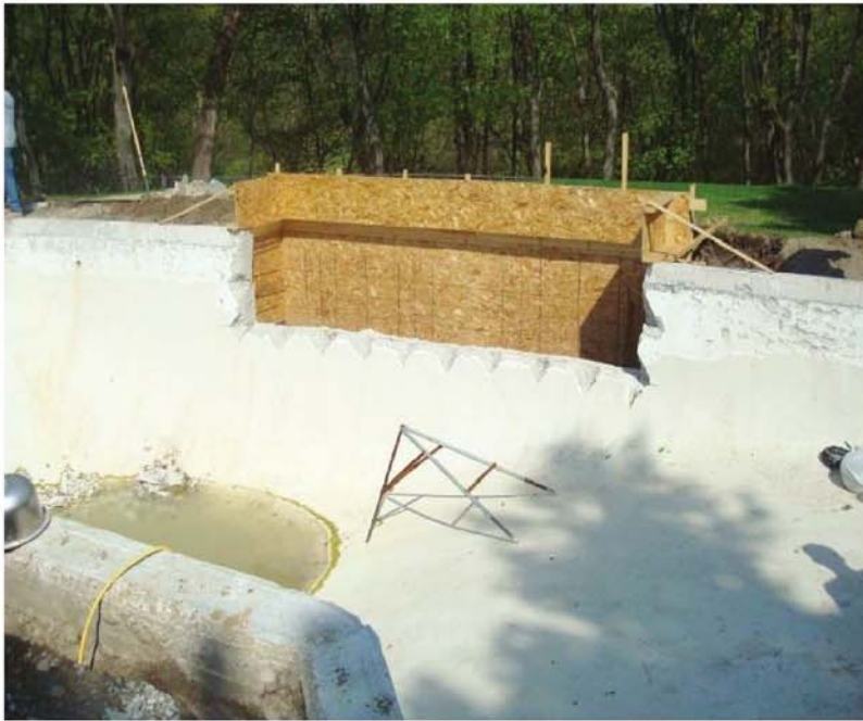
A 4.3-m (14-ft) section of the pool wall was cut away to accommodate a new water feature. It was placed on the far side of the pool to be the visual point of interest from the kitchen.